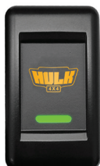
HU1361AG-10H HULK4X4 Logo