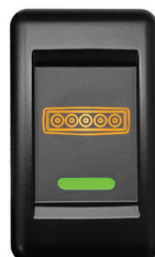
HU1361AG-03 Work Lights