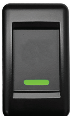
HU1361AG-10 Window Logo