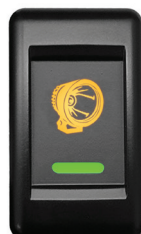
HU1361AG-37 Search lights