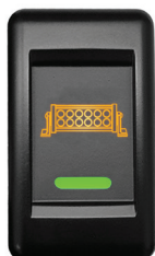
HU1361AG-02 LED Light Bar