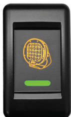
HU1361AG-01 Driving Lights