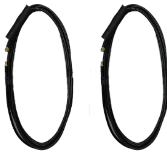
Coaxial Cable x 2 Cellular (SMA M to F) UHF CB (FME M to F)