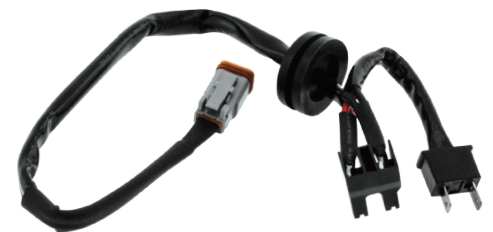
IWH008 H7 Headlight Adaptor Kit