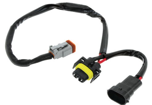
IWH014 HB4 Headlight Adaptor Kit

IWH013 Universal Headlight Adaptor Kit suits vehicles with \HID or LED Headlights.