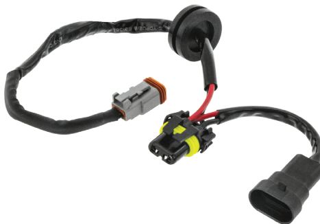
IWH007 HB3 Headlight Adaptor Kit