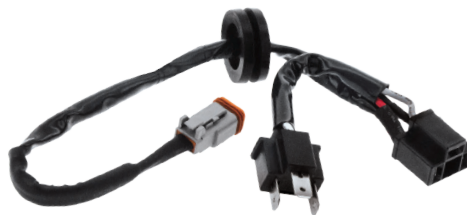
IWH005 H4 Headlight Adaptor Kit