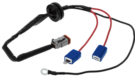
IWH006 H1 Headlight Adaptor Kit

The Headlamp Adaptor Kit Part Numbers are;