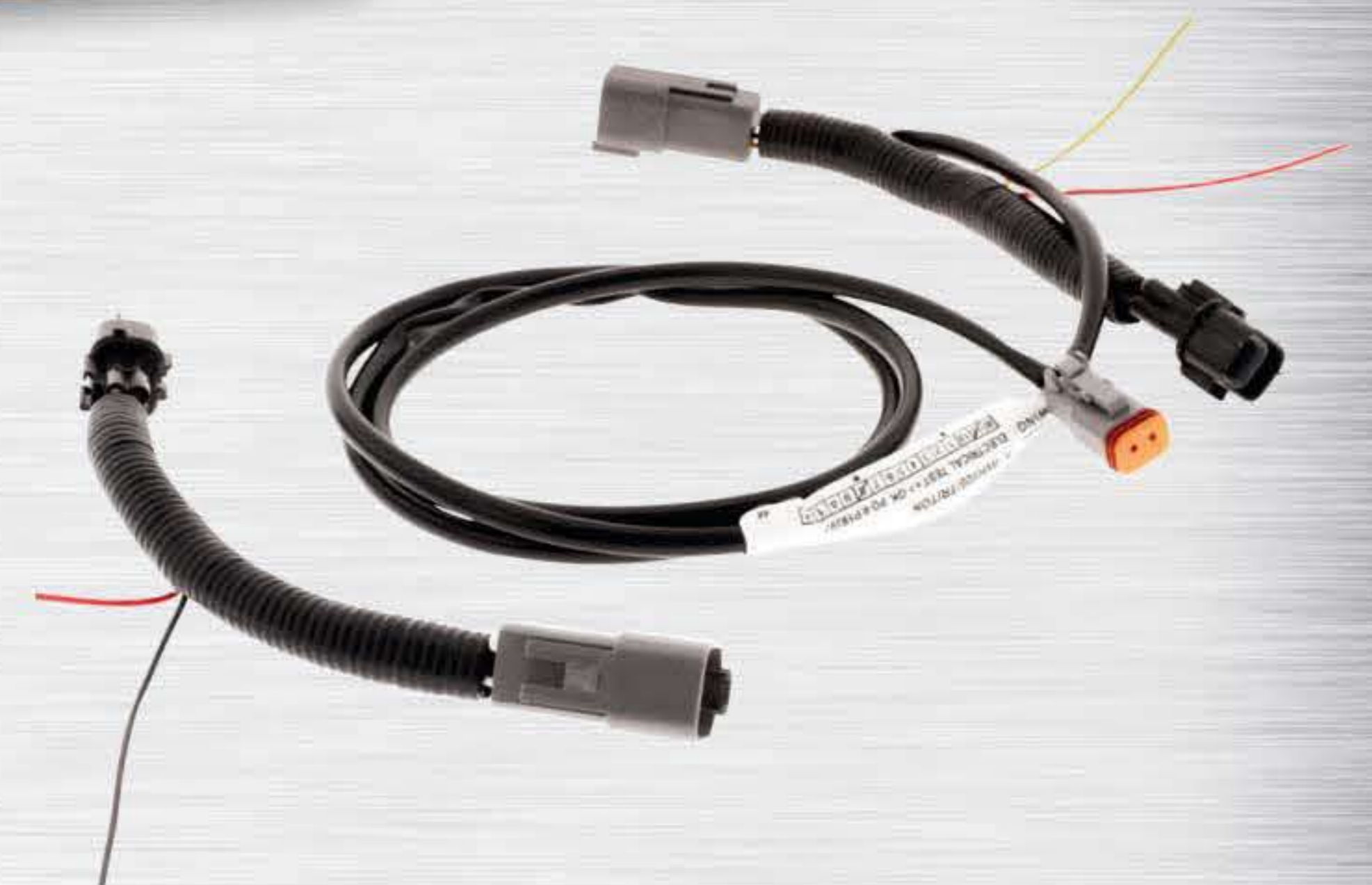
IWH100 Rear Combination Lamp Wiring Harness Kit Suits Mitsubishi Triton 2009 – Onwards