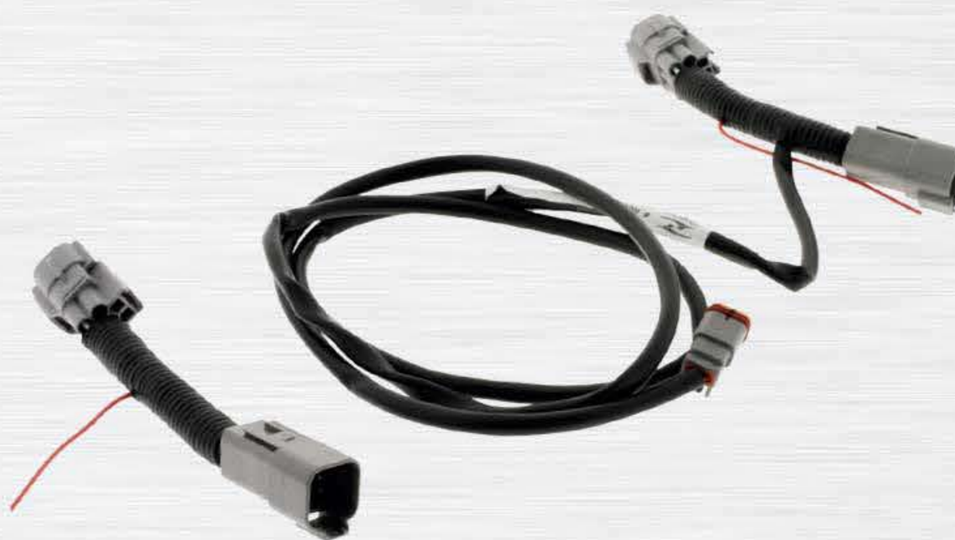
IWH400 Rear Combination Lamp Wiring Harness Kit Suits Toyota Hilux 2005 - Onwards and 75 Series Landcruiser 2007 Onwards