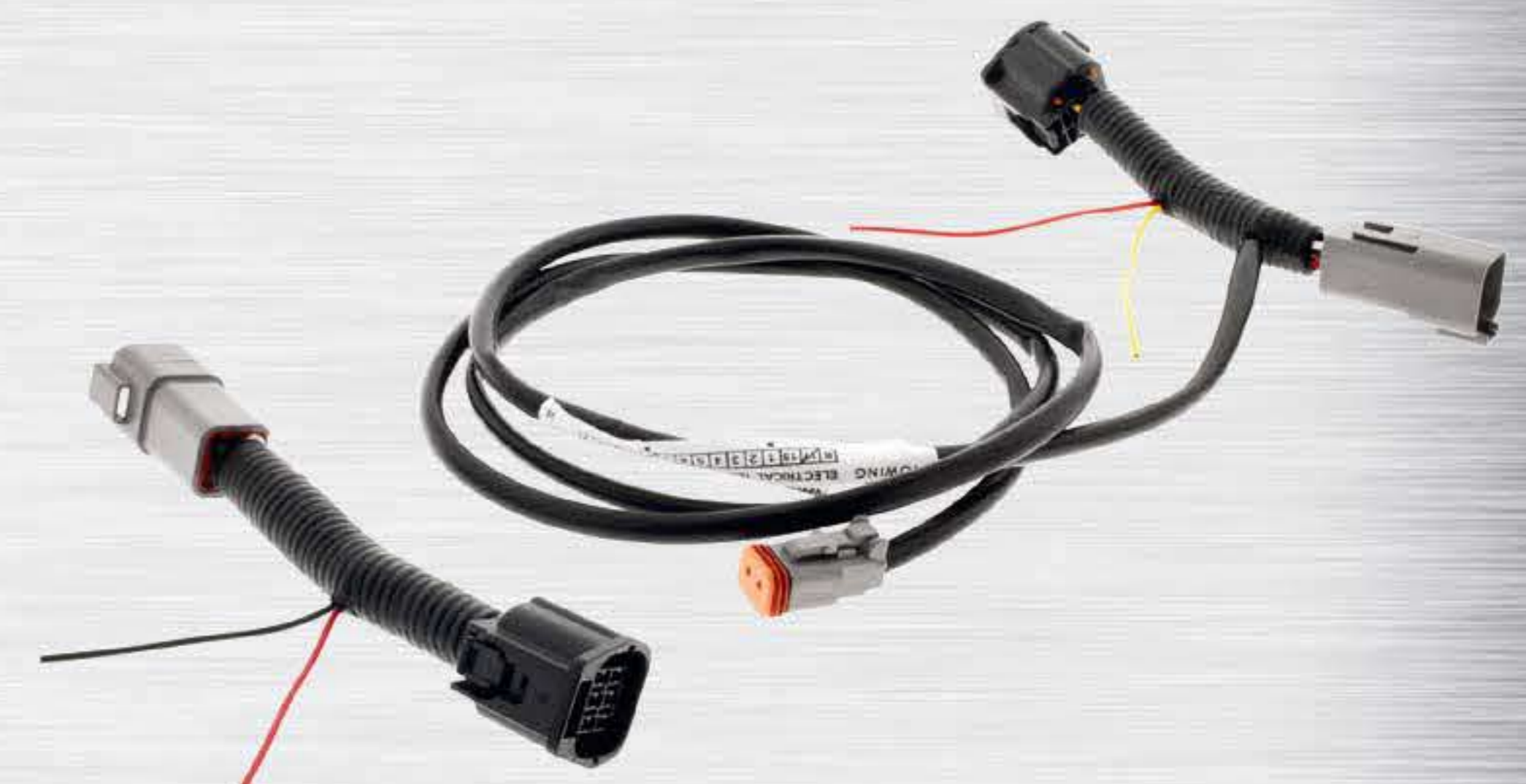
IWH600 Rear Combination Lamp Wiring Harness Kit Suits Ford Ranger and Mazda BT-50 2006 – Onwards