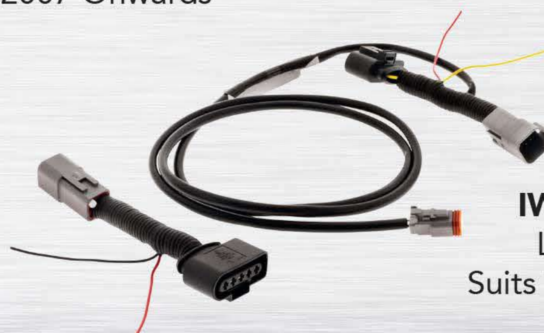
IWH700 Rear Combination Lamp Wiring Harness Kit Suits VW Amarok 2012 – Onwards

We recommend using the Jaylec LED Load Resistors, Part No's LR0012 for 12 Volt applications or LR0024 for 24 Volt applications. Or alternatively you can exchange the vehicles existing Indicator Flasher Can with a new LED unit. Please contact your local Cooldrive branch for the appropriate part numbers.