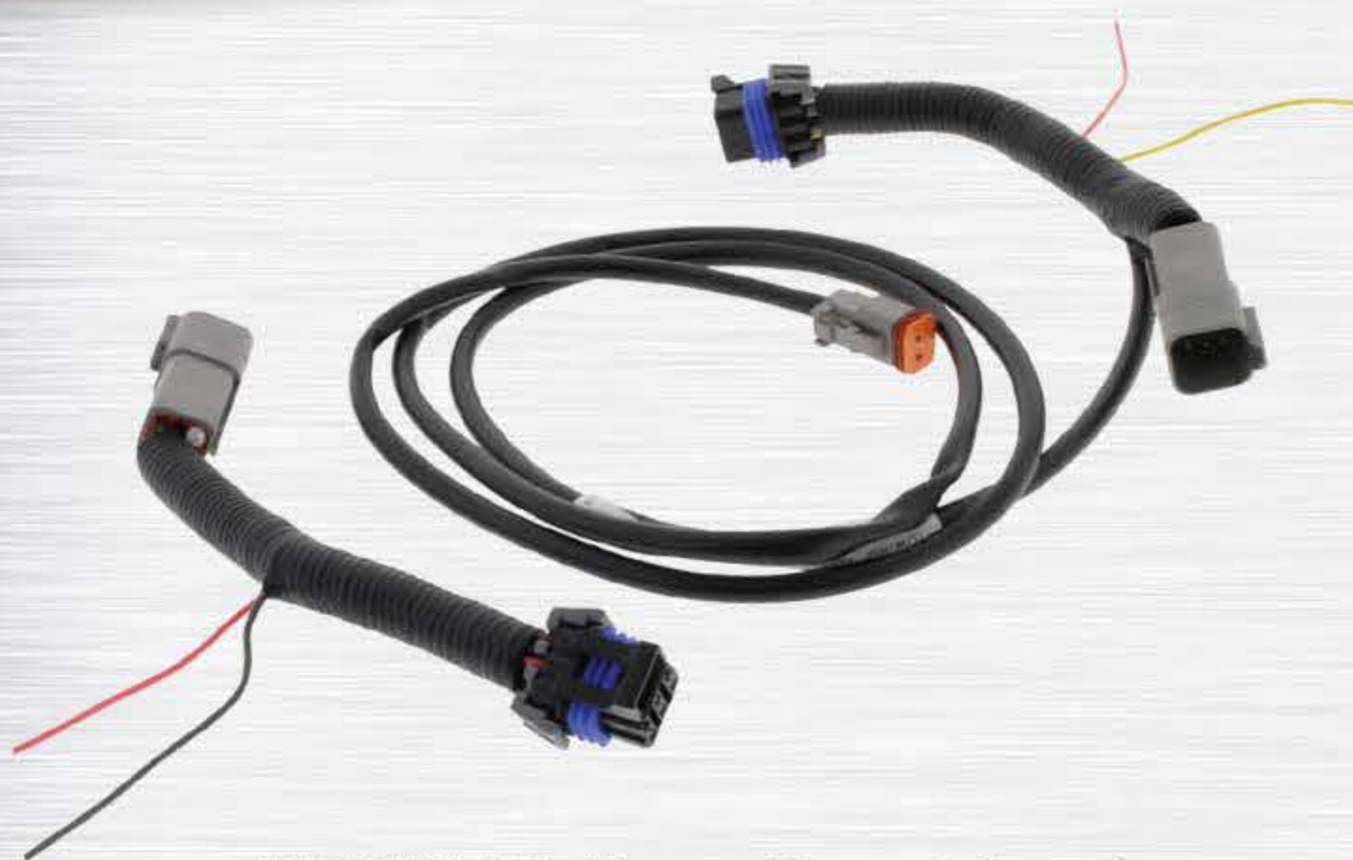
IWH060 Rear Combination Lamp Wiring Harness Kit Suits Holden Colorado 2012 – Onwards