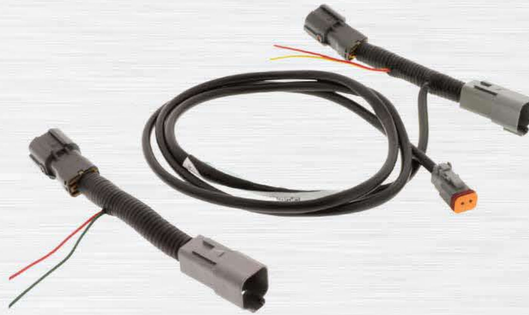
IWH080 Rear Combination Lamp Wiring Harness Kit Suits Isuzu D-Max 2008 -