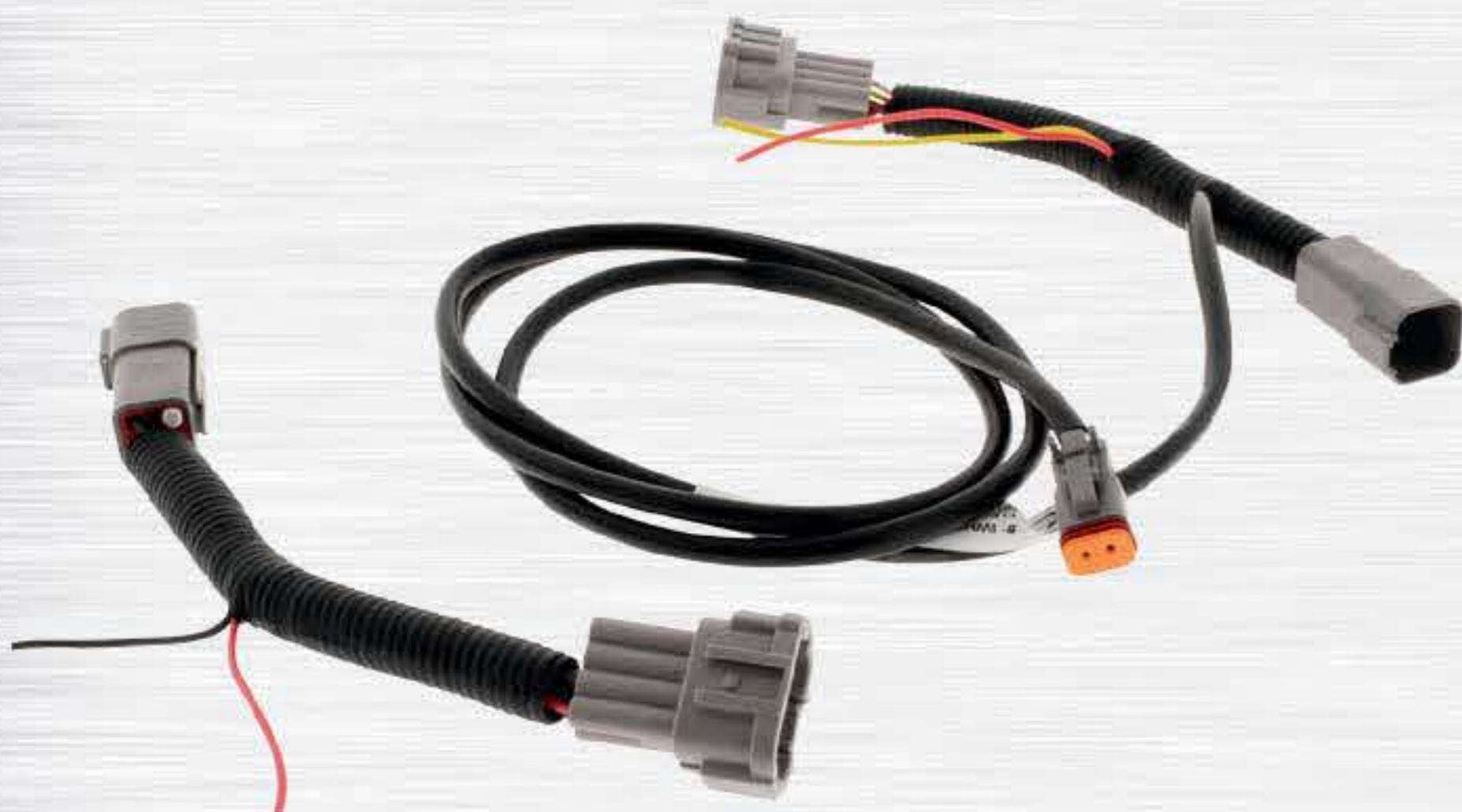
IWH200 Rear Combination Lamp Wiring Harness Kit Suits Nissan Navara NP300 2014 – Onwards