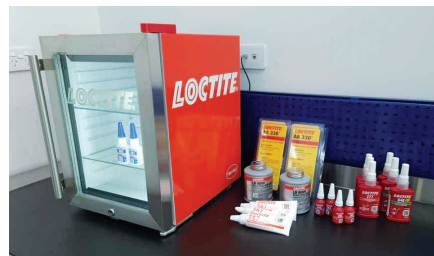
As used by CoolDrive Racing