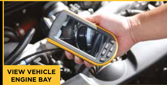
VIEW VEHICLE ENGINE BAY