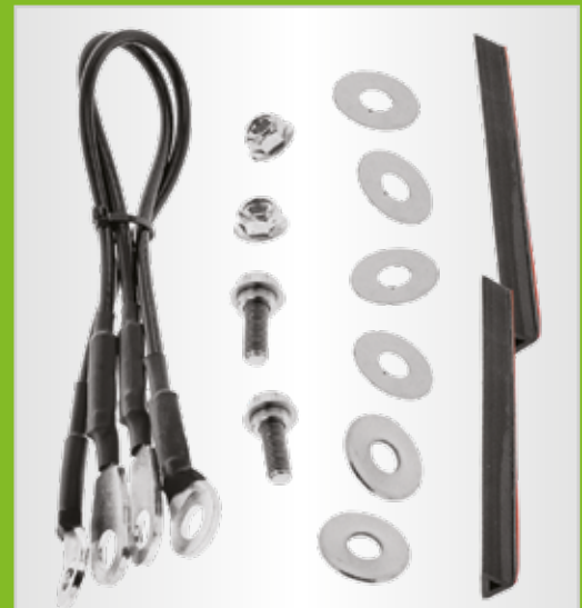
MOUNTING HARDWARE INCLUDED