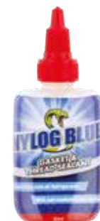
OG7201 Nylog Sealant 30ml

Compatible with all refrigerants, it will not contaminate the system