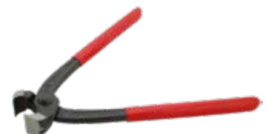
TOAC3801 Flat Crimper Pliers