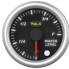
HU8402 Water Level