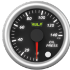
HU8406 Oil Pressure