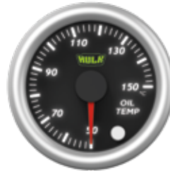
HU8403 Oil Temp