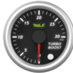
HU8407 Boost Diesel