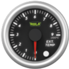
HU8405 Exhaust Temp