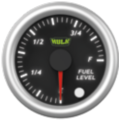
HU8400 Fuel Level