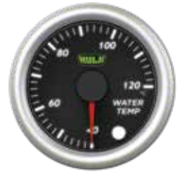
HU8404 Water Temp