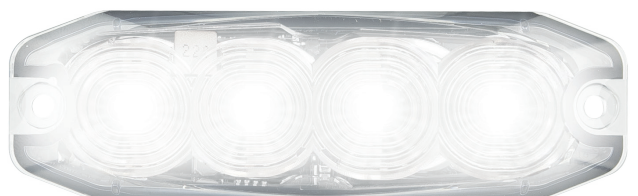
Part No: 120034WM (Class 2)