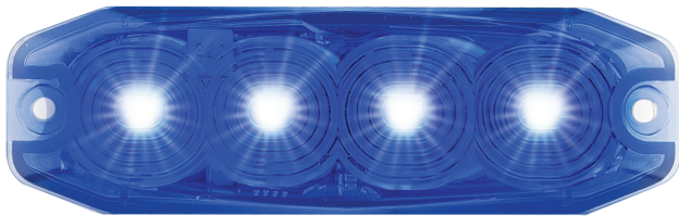
Part No: 120034BM (Class 1)