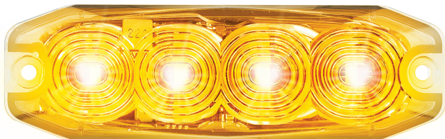
Part No: 120034AM (Class 1)