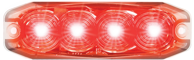
Part No: 120034RM (Class 1)