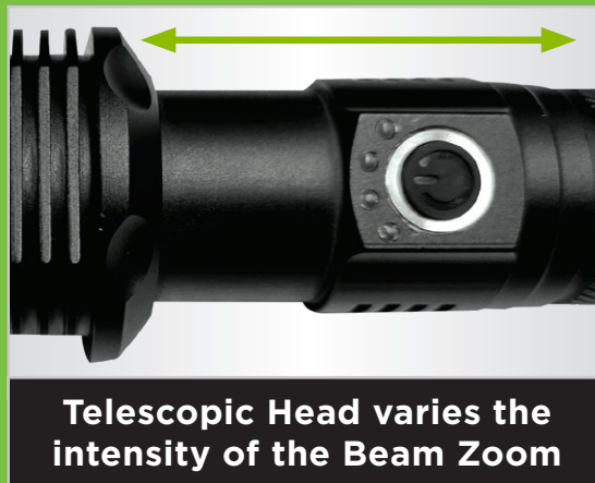
Telescopic Head varies the intensity of the Beam Zoom