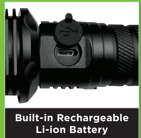
Built-in Rechargeable Li-ion Battery