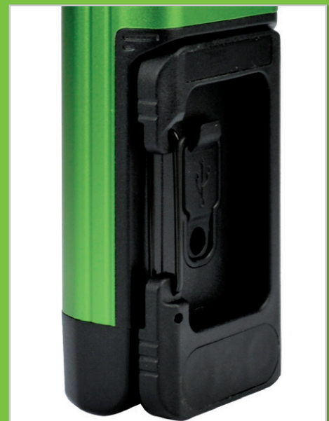
Magnetic Base and Clip Swivel Hook