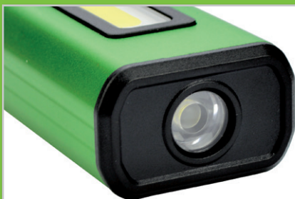
LED Torch Function

HULK PROFESSIONAL SERIES BIG. STRONG. TUFF.