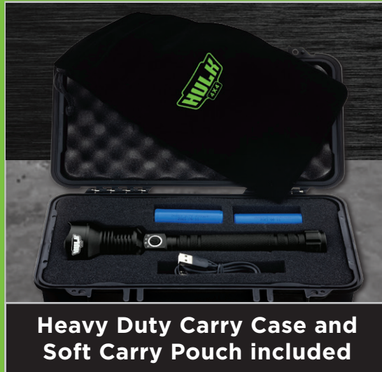
Heavy Duty Carry Case and Soft Carry Pouch included