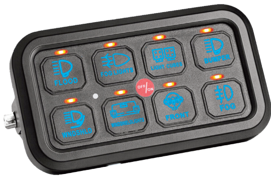
Part Number: HU1300 (Blue Backlit Panel)

The HULK Professional Series Smart 8 Switch panel is ideal for 4WD's, SUV's, Caravans and Trucks. This system allows you to control up to 8 different auxiliary LED light or electrical devices.