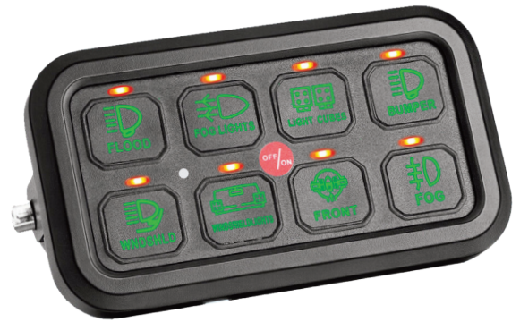
Part Number: HU1301 (Green Backlit Panel)