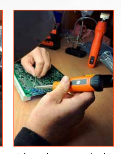
A fast re-charging time of under 60 seconds, provides up to 45 minutes working time and a maximum temperature of 450 degrees Celsius gets the job done.