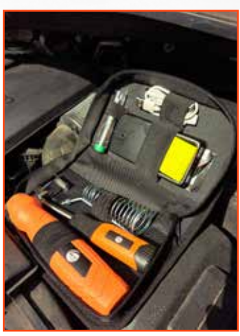
Includes handy storage case.